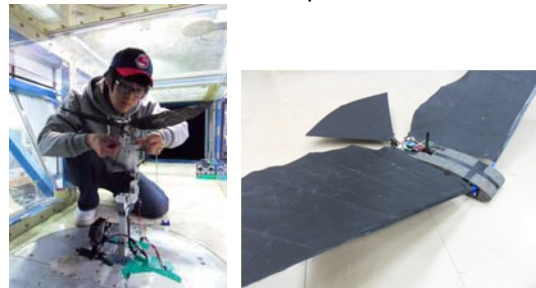
Fig. 3 Flapping air vehicles at KAIST

In addition to the analytical works, a series of model flappers, developed at SSS lab. of KAIST, will be introduced in this talk (See Fig. 3). The development process as well as flight and wind tunnel test results will be presented.