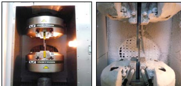
Fig. 1: Test set-ups for ETW(left) and CTD(right)